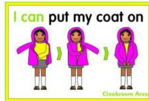
Put on coat and do it up