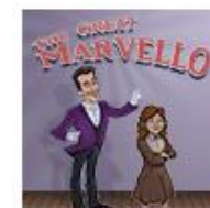
The Great Marvello