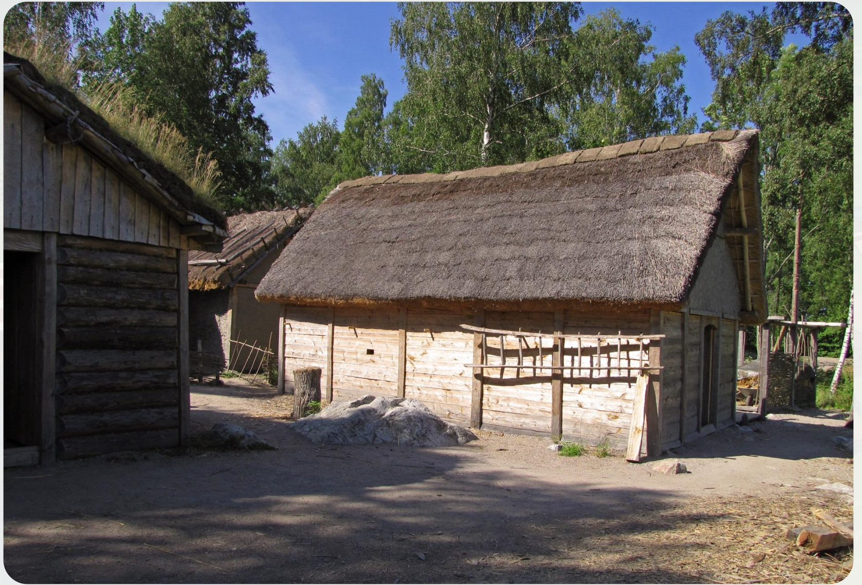
Photo courtesy of JsnLind(@flickr.com) - granted under creative commons licence - attribution