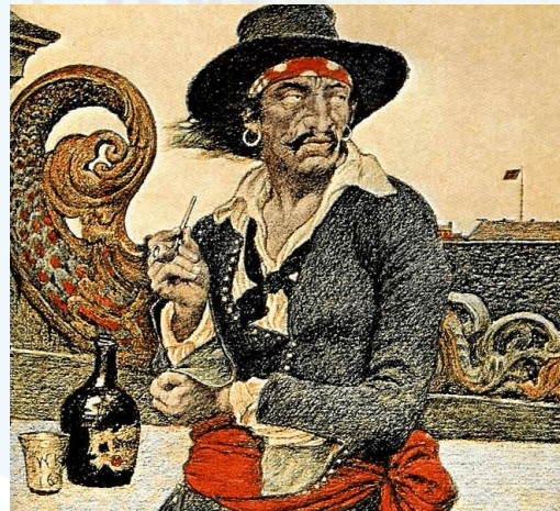
Captain William Kidd