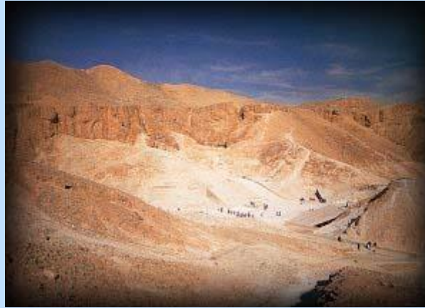
Valley of the Kings

He was buried in a hastily prepared tomb in the Valley of the Kings at Thebes, the traditional burial place of his predecessors. The person responsible for his burial, and shown on one of the walls in Tutankhamun's tomb, was Ay who succeeded him on the Egyptian throne.