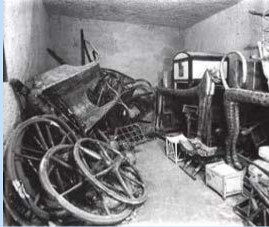
Egyptian treasures found in Tutankhamun's tomb

The small tomb contained hundreds of objects (now housed in the Egyptian Museum in Cairo), many richly decorated and covered in gold, that would be needed by the king in his afterlife.