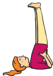
shoulder stand pose