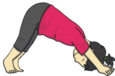
downward facing dog pose