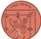
2p Two Pence