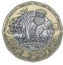
£1 One Pound