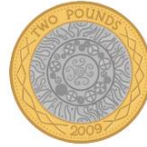
£2 Two Pounds

Day 2 Create your own shop at home. Price up all the items (make up your own prices – if children are not familiar with larger numbers, keep the prices under 20p) and choose the coins that you need to pay for them. Draw them in your book – see the example below