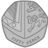
50p Fifty Pence