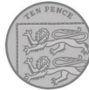
10p Ten Pence